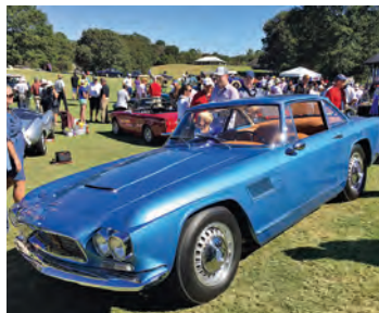
2016 Best of Show Post-War Elton Stephens' 1961 Maserati Frua Prototype