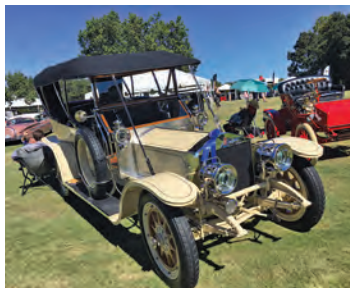
Best of Show Overall DeNean Stafford III's 1909 Rolls-Royce Silver Ghost