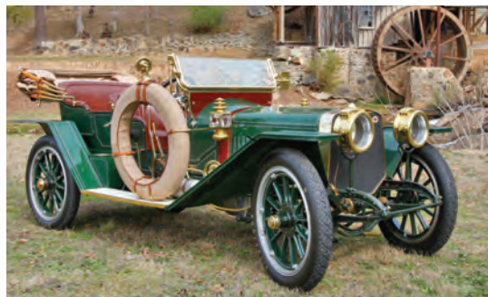
Be sure not to miss the display of rare Loziers, America's first supercar

Finally, the Atlanta Concours is featuring a class for Lozier automobiles. Built during the turn of the cen-