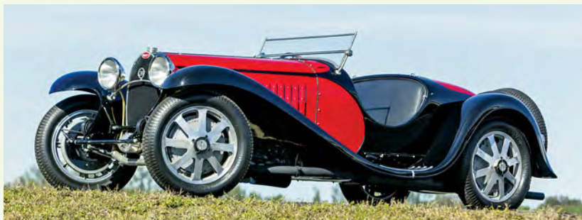
Bonhams Star Car: 1932 Bugatti Type 55 Jean Bugatti roadster