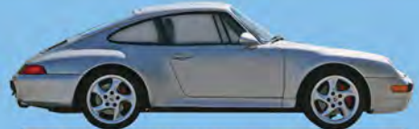
1997 PORSCHE 911 C4S VIN: WP0AA2996VS320787 Western car; Great color combo; Includes documentation.