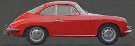
1965 PORSCHE 356C VIN: 220576 Comprehensively restored; Numbers-matching; with COA.