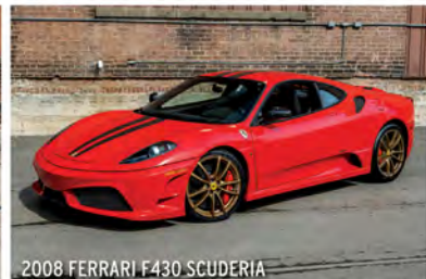
2008 FERRARI F430 SCUDERIA