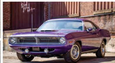
1970 PLYMOUTH CUDA