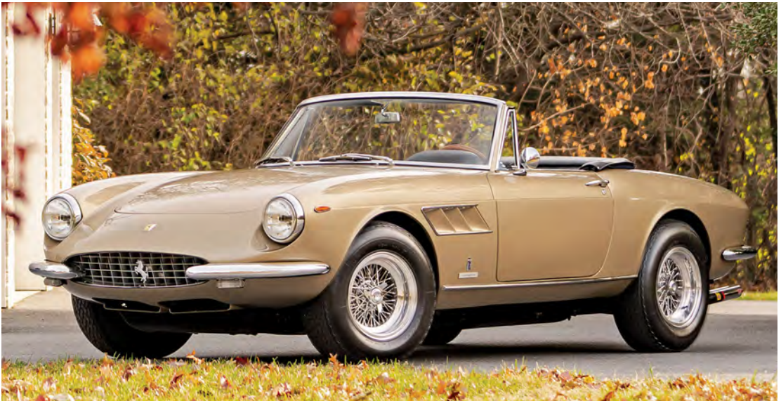
1967 Ferrari 330 GTS

This is Bonhams' sixth year selling on the island. Each auction seems more stacked with quality consignments than the last one. The fine selection of cars is on offer at an earlier time slot than the rest of the Amelia auctions. As an example of the variety of lots, last year, a 1930 Cadillac 452A V16 Fleetwood roadster topped the sales chart at $1,187,500, while a 2015 McLaren P1 was the high seller at $1.7m in 2018.