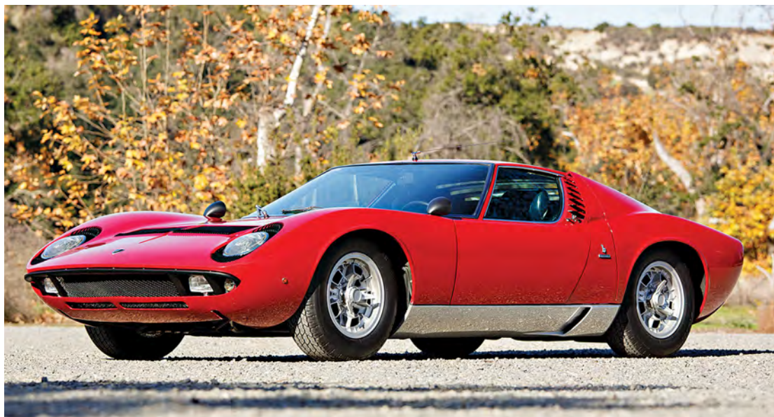
1969 Lamborghini Miura P400 S

Gooding & Company's 11th annual Amelia Island auction promises to be another exciting event. This is the auction house's flagship East Coast sale, which often delivers the finest-quality classic and sports-car marques. The single-day auction offers automobiles from the pre-war era up to modern supercars and offers something for every enthusiast and collector to marvel at. Six lots sold above the $1m mark at the 2019 sale.