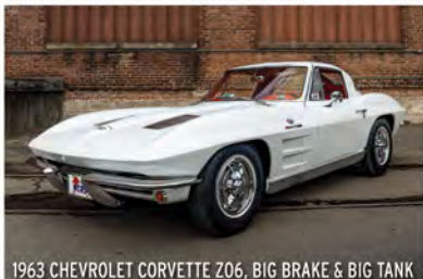
1963 CHEVROLET CORVETTE Z06, BIG BRAKE & BIG TANK