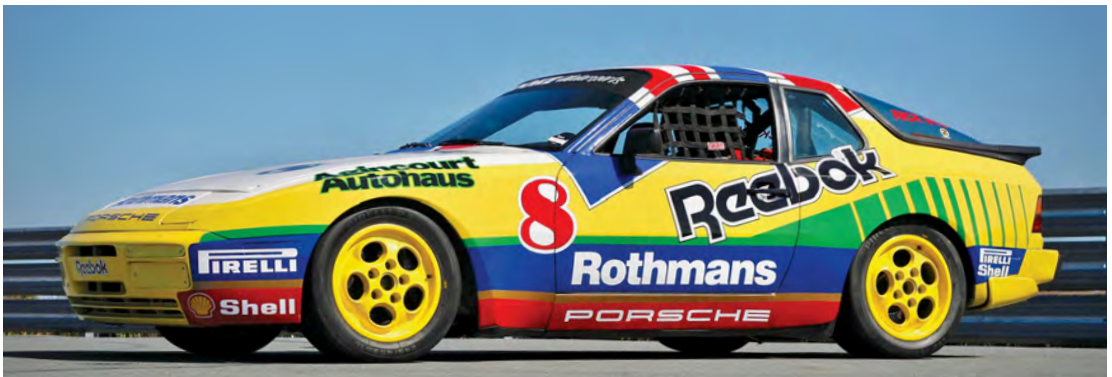
1988 Porsche 944 Turbo Cup. Ex-Rothmans Porsche Turbo Cup

1988 Porsche 944 Turbo Cup. Ex-Rothmans Porsche Turbo Cup, multiple podium finishes. (Contact Bonhams for estimate; offered with no reserve.) ■