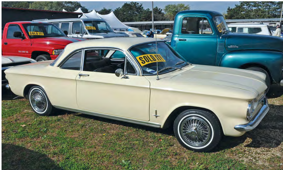
Looking for a bargain? SG Auction in Winona, MN, caters to the more budget-conscious car collector