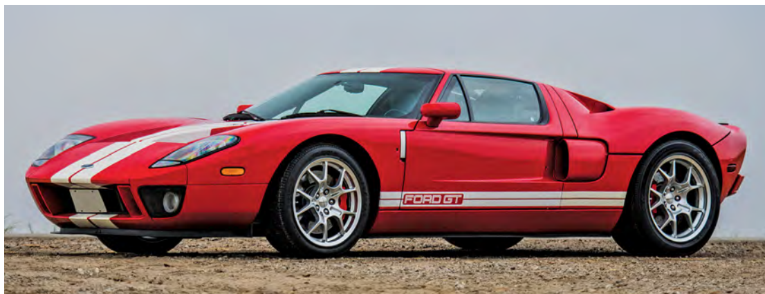
2006 Ford GT

Celebrated as one of South Florida's premier collector-car auctions, RM Auctions is moving up the road to the Palm Beach International Raceway for their spring sale. Expect approximately 300 cars to cross the auction block. With consignments ranging from American classics to European sports cars, muscle cars to modern collectibles, this sale caters to all segments of the market.