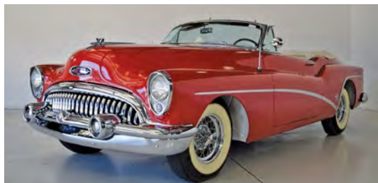
1953 Buick Skylark

1968 Pontiac Firebird Pro-Touring custom coupe. This Pro-Touring coupe is powered by a 550-hp LS3