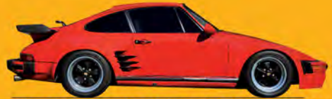
1979 PORSCHE 911 SLANTNOSE VIN: 9118201436 California Car; Well-sorted; Great options & color combo.