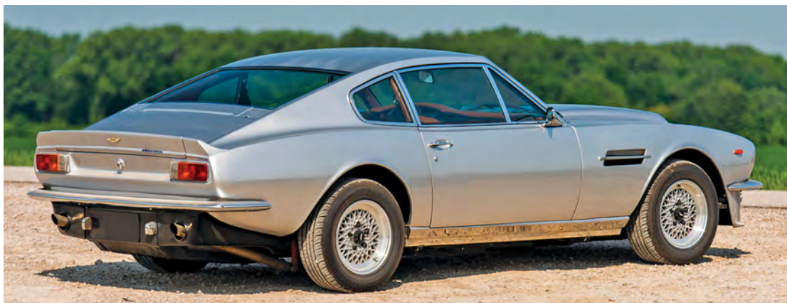
1977 Aston Martin V8 Vantage "Bolt-On Fliptail" coupe

1969 Porsche 911S coupe. (Offered with no reserve.) ■