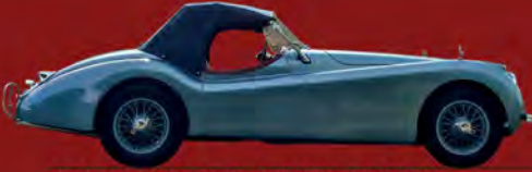
1954 XK-120 SE 3.4L OTS VIN: S674424 Numbers-Matching, Professionally restored, Show-Level.