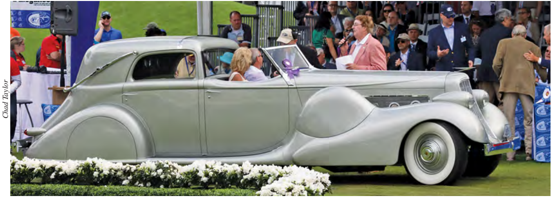
There's an impressive silver trophy if ever there was one