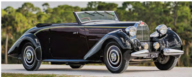
RM Sotheby's Star Car: 1938 Bugatti Type 57 Aravis

Star Car We have some great classics in store for our 2020 Amelia Island auction, and the 1938 Bugatti Type 57 Aravis has to be the standout. This is a truly gorgeous car, one of only two Type 57s bodied by D'Ieteren and the only example in this body style. It's offered from a prominent private collection wearing a well-maintained and freshened restoration completed in Europe. The car toured Europe in-period, and was invited to both Pebble Beach and Villa d'Este following restoration; it won class awards at each, and is now eligible to return. It is presented in two-tone black and maroon with dark cherry sides and extremely attractive rear-end styling, complete with its original fitted luggage in the trunk. This is one of the renowned European classics and we anticipate several collectors looking to add it to their collection this spring.