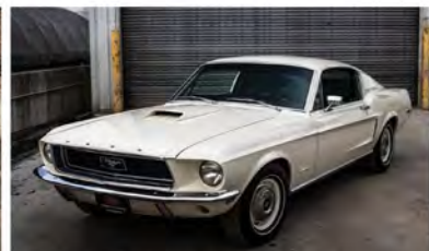
1968 FORD MUSTANG TASCAS LIGHTWEIGHT

Unrestored "time capsule" with tank sticker still on tank. Highly documented, Bloomington Gold Certified, NCRS Top Flight and featured in the L88 Libraries