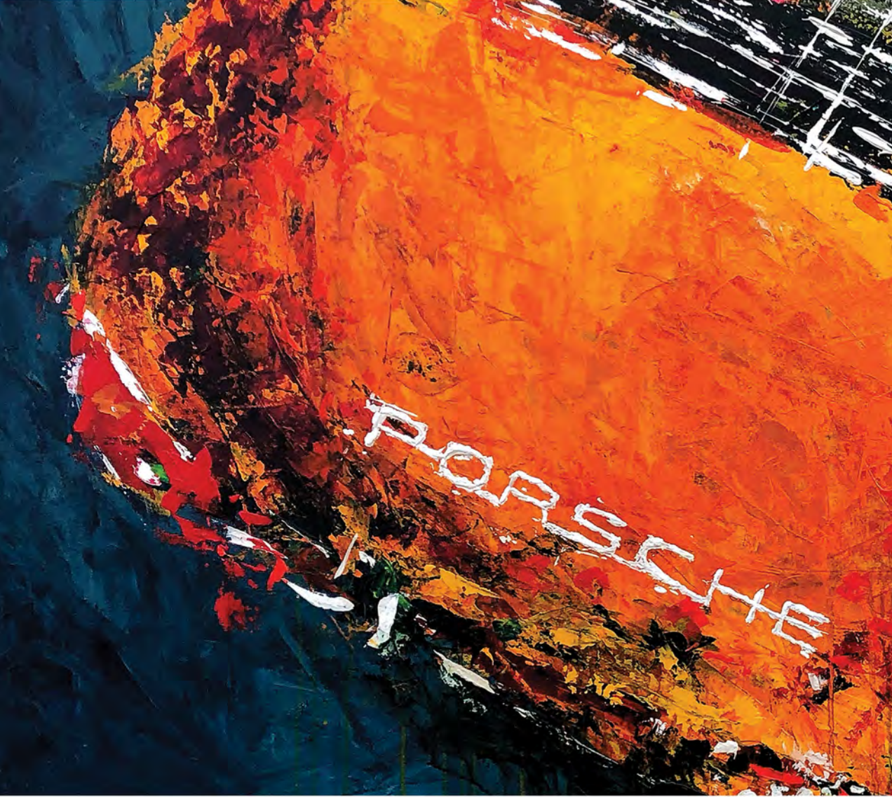
DETAIL IMAGE OF "GRETA" - 1964 911 EURO, ACRYLIC ON CANVAS

UNIQUE WORKS OF FINE ART • ONLINE GALLERY AND COMMISSION INQUIRIES