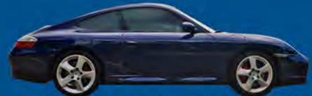
2004 PORSCHE 911 C4S VIN: WP0AA29954S620366 California original car; Great color combo; Low miles.