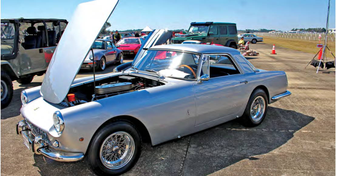
Russo's top-selling car from the 2019 auction was this 1961 Ferrari 250 GT PF coupe, sold for $665,600

Russo and Steele returns to the Amelia Island party for the second year in a row. This two-evening event is expected to feature a wide range of collectible automobiles crossing the high-energy “auction in the round” block. Located at the east end of the Fernandina Beach Airport, it's just 10 minutes from the Amelia Island Concours d'Elegance. A 1961 Ferrari 250 GT coupe topped last year's inaugural sale at $665,600.