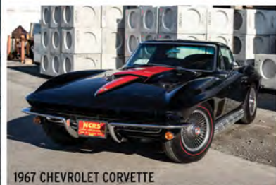
1967 CHEVROLET CORVETTE

6-speed; last of the gated manuals. One owner, fully serviced, full books, tool, factory cover and original window sticker