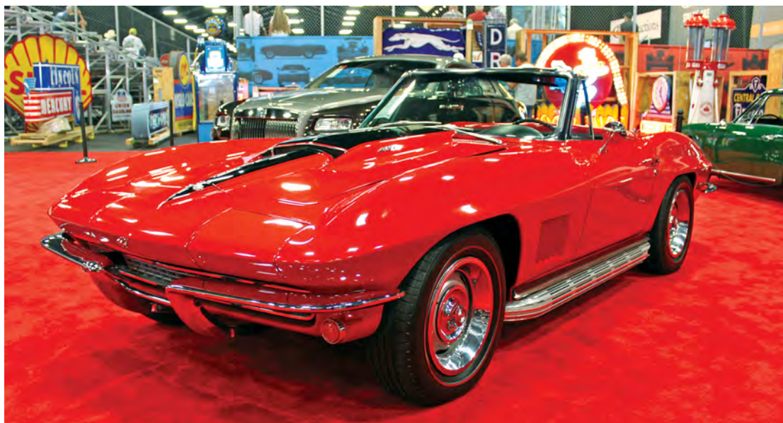
From elegant classics to American muscle, RM Auctions' sale in Auburn, IN, offers something for all tastes