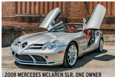
2008 MERCEDES MCLAREN SLR, ONE OWNER