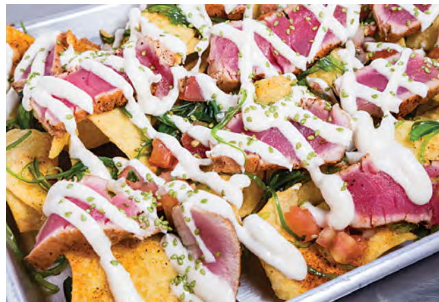
Deliciousness awaits at Salty Pelican Bar & Grill

Salty Pelican Bar & Grill 12 N Front St. Fernandina Beach, FL 32034 904.277.3811 ■