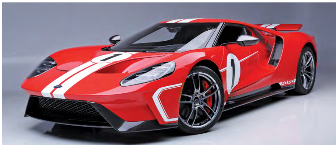
2018 Ford GT '67 Heritage Edition

Barrett-Jackson sold 640 of 643 cars at this sale last year — good enough for a 99.5% sell-through rate. The South Florida Fairgrounds serve as backdrop for Barrett-Jackson's annual Florida sale, where 500-plus mostly no-reserve consignments will cross the block. The automobilia auction offers some of the rarest or one-of-a-kind collectibles, quite often at no reserve. Whatever you're looking for, you'll likely find it here, as this auction tends to have a wide range of offerings.