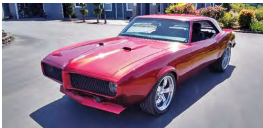
1968 Pontiac Firebird Pro-Touring custom coupe

Preview: Thursday, April 16, gates open 8 a.m.