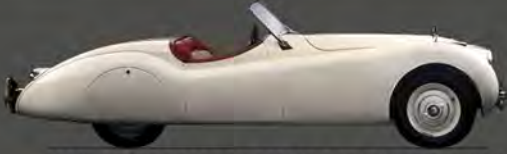
1950 JAGUAR XK-120 ALLOY 3.4L OTS VIN: 670121 Preserved original; Numbers-matching; Great history.