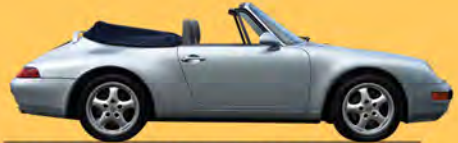
1995 PORSCHE 993 VIN: WP0CA2996SS342292 Spectacular example; Well-maintained, Great color combo.