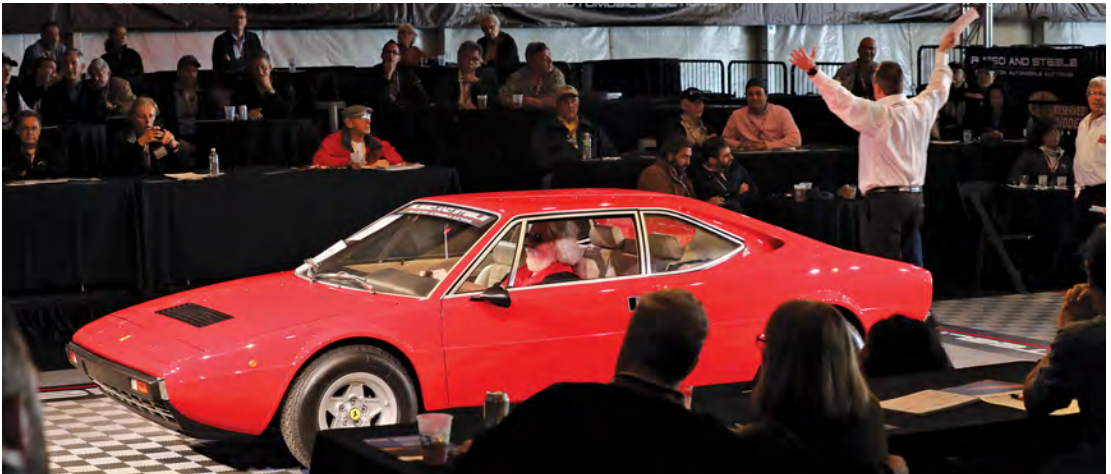
Last year, this 1976 Ferrari Dino 308 GT4 Euro 2+2 coupe sold at $92,600

Cost: General admission is $30 per person per day. Bidder's registration fee is $325, which includes one bidder's pass and one guest pass; additional guest passes are available for $75 each.