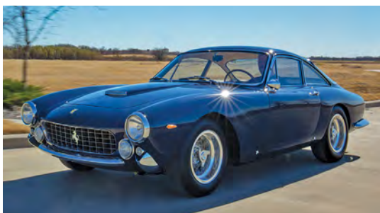
1963 Ferrari 250 GT/L Lusso by Scaglietti

Cost: Admission to the preview is open to the general public during viewing hours. $300 bidder registration includes auction admission and admits two. Admission to the auction is limited to registered bidders, consignors and qualified media only. View updated event details at rmsothebys.com .