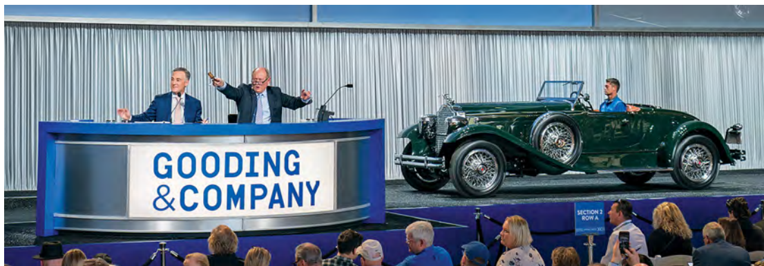
Gooding & Co.'s top seller last year was this 1930 Packard Deluxe Eight Series 734 Speedster Runabout, at $1,765,000

view is a rare, unrestored 1969 Lamborghini Miura P400 S . (Contact Gooding & Company for estimates.)