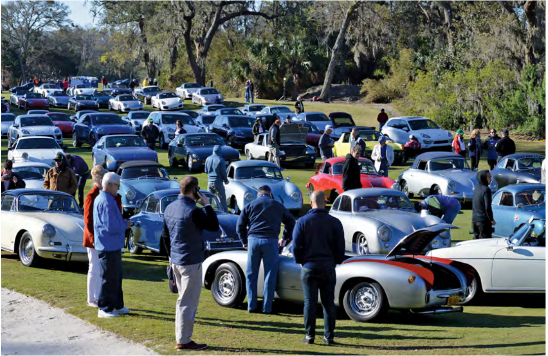
Porsche Werks Reunion at Amelia Island