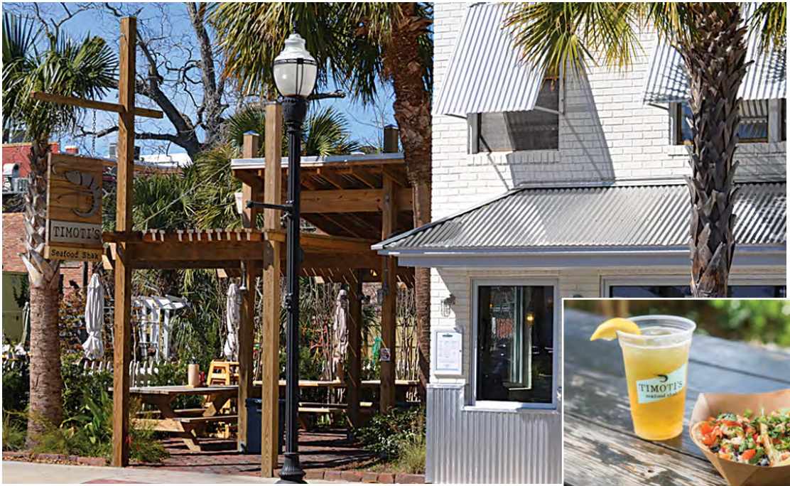
Timoti's Seafood Shak