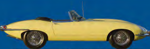
1965 XKE Series 1 4.2L OTS VIN: 1E10570 Preservation-Level, Highly original example, 1 owner.