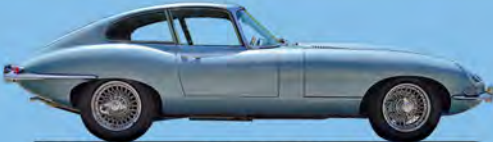
1966 XKE Series 1 4.2L FHC VIN: 1E32792 Rotisserie restored, Show-Winner, Great color combo.