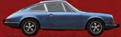
1973 PORSCHE 911T COUPE VIN: 9113101187 Comprehensively restored; Numbers-matching; with COA.