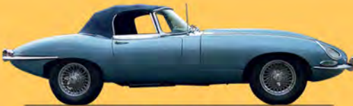
1965 XKE Series 1 4.2L OTS VIN: 1E10502 Comprehensive restoration, Spectacular color combo.