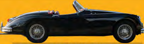
1959 XK-150 3.4L OTS VIN: T831604DN Original Preserved, Numbers-matching, Great color combo.