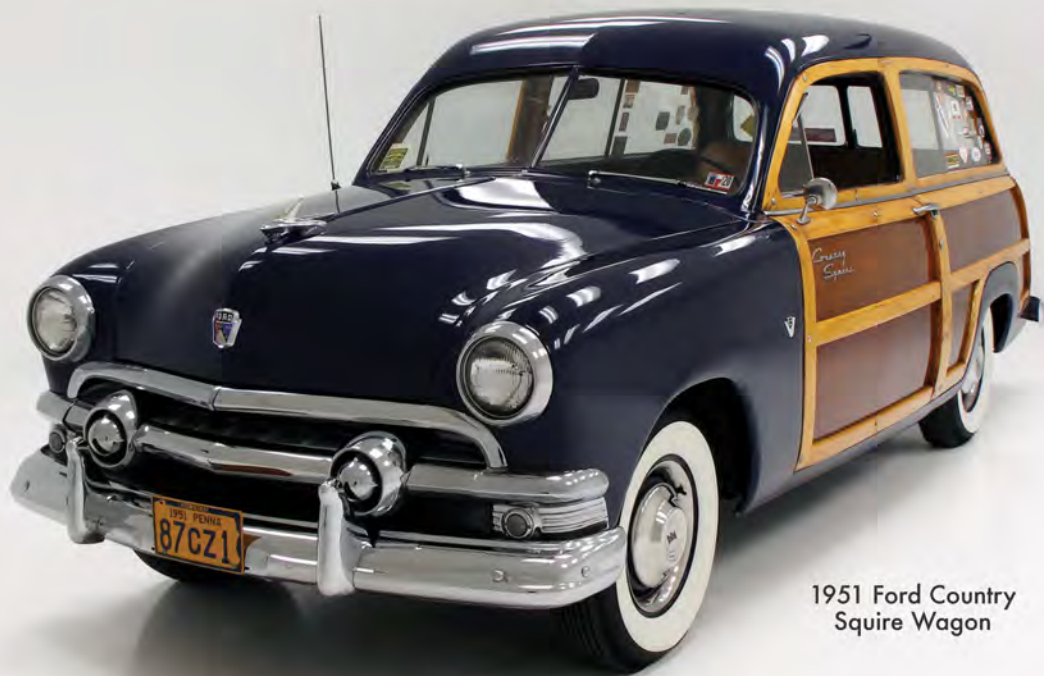
1951 Ford Country Squire Wagon

When It's Time To Say Goodbye Only the Best Will Do.