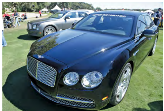
Festivals of Speed is a luxury lifestyle motorsports event showcasing exotic vehicles of all types